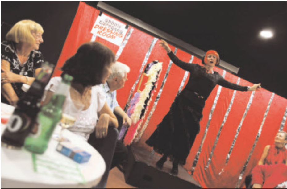
Eyes up - a scene from Bingo!