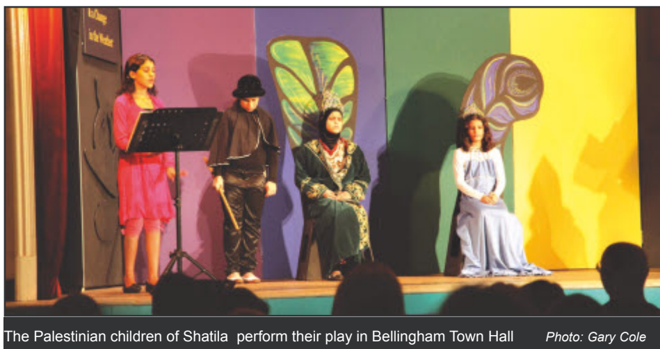
The Palestinian children of Shatila perform their play in Bellingham Town Hall

The day also included workshops, a bookfair, readings, a children's tent, and wonderful home cooking.