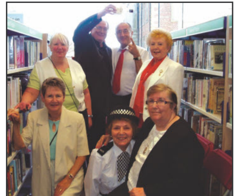
Some Sixties Group actors in the wings before their latest show, Strangers on a Bus .

Cloud Nine's Sixties Group are weathering the funding storm , thanks to support from North Tyneside Council. They have been working for several weeks with Peter Mortimer developing the characters and storyline for a full length play which is called, Playtime . Subtitled A Spirited Comedy , this is the tale of a group of characters who take on the production of a mysterious new play, only to discover they have unleashed powers they were unaware of.